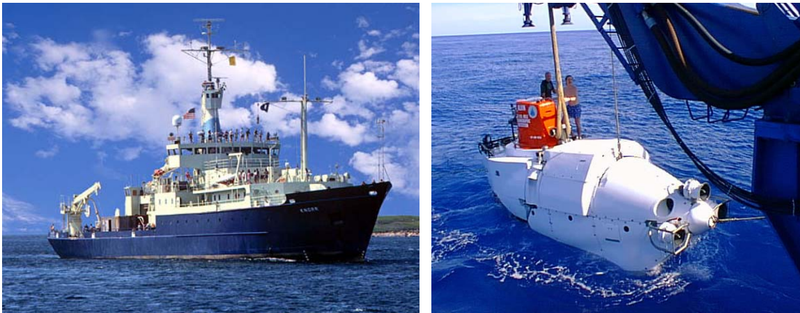
Figure C.2 WHOI research vessels Knorr (left) and Alvin